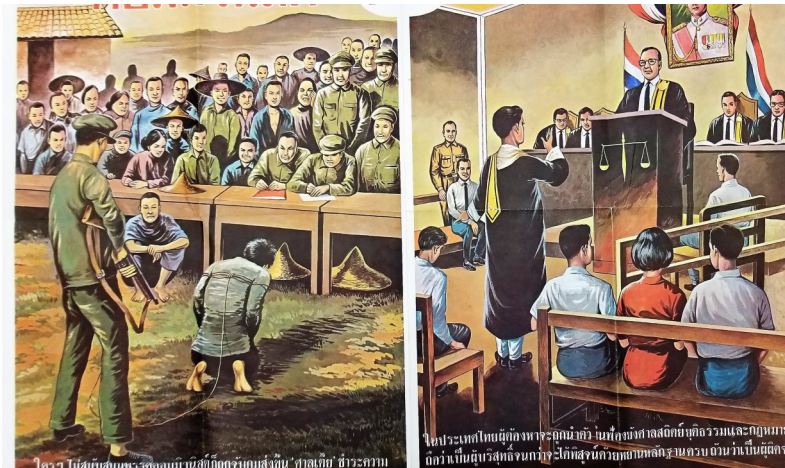
Thai anti-communist poster that contrasts life under a communist regime with life in a democratic society. It contrasts the so-called "people's court" in China and the court in Thailand