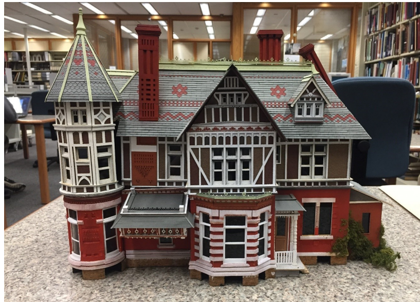
Haish Mansion model

Founders Memorial Library (815) 753-1094 https://library.niu.edu/ulib